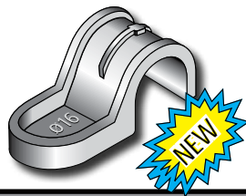
PVC conduit clips for C3-ST