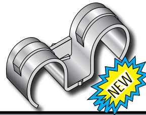
Double Conduit clips (PVC)