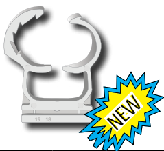
Self locking pipe clamps